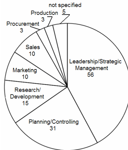
Fig. 2. Participants by functional areas

In a next step we conducted an exploratory factor analysis 1 . Factor analysis is a collective term for the