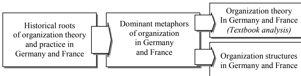
Fig. 1. Argument chain of the study

The differences between the images that underlie the way German and French scientists and practitioners approach organizations may basically be reduced to two metaphors: chart and sail. In German organization theory and practice there is a dominant image of an organization as an essentially centripetal entity and as a structure for the efficient differentiation and integration of individual tasks with a view to a common, tangible goal. French organization theory and practice, however, is predominantly determined by an image of an organization as a temporary arrangement and common guiding image for its various interested parties towards the achievement of a given goal.