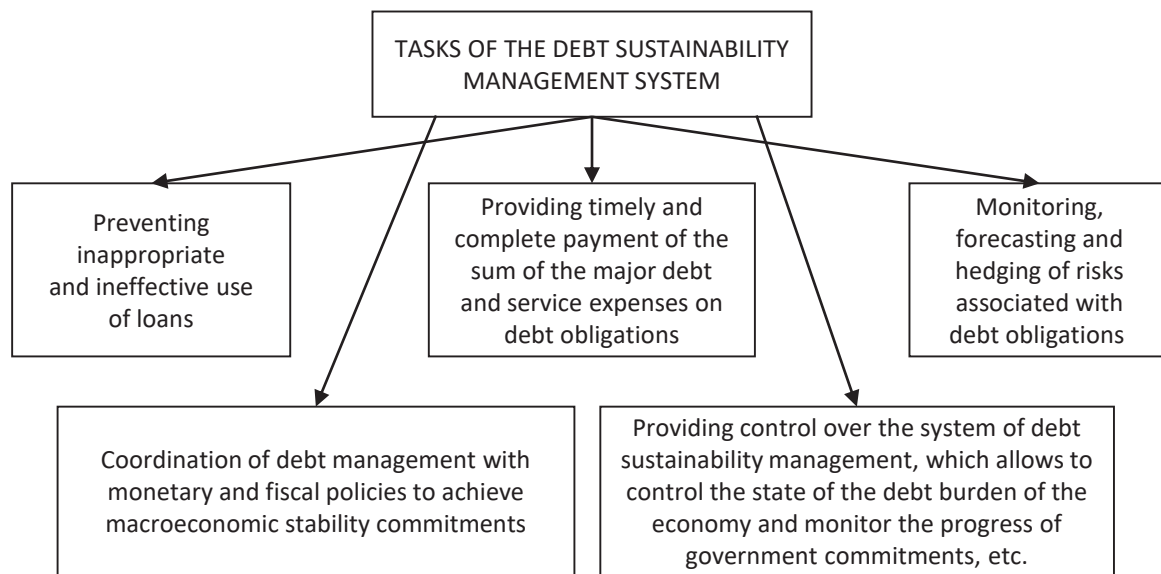
Figure 1. Tasks of the state's debt sustainability management system