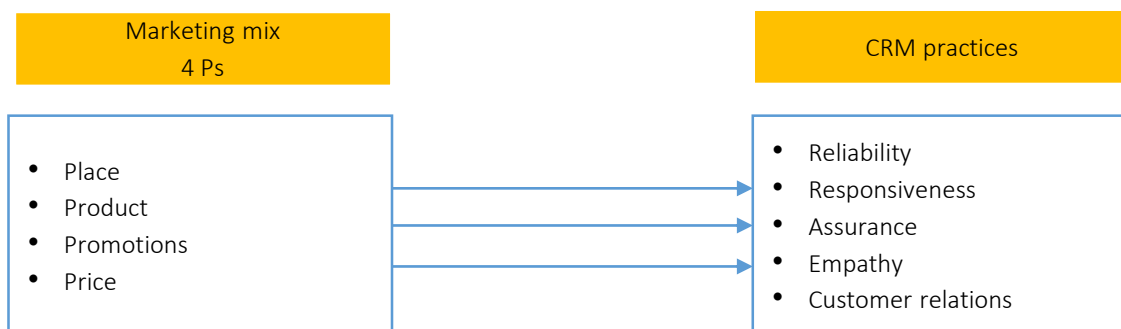
Figure 1. Model of the study