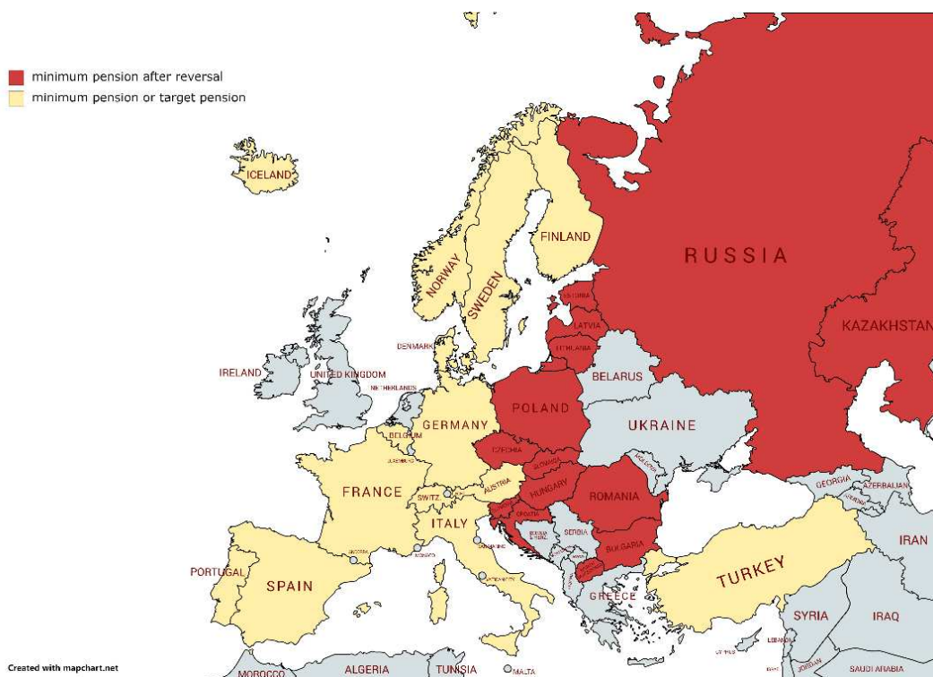
Figure 3. Implementation of minimum pension guarantee in Europe

Figure 3 points to a convergence process of implementing minimum pension guarantee or target pension after pension reform reversals from a global perspective. Central and Eastern European countries that have been through pension reform during the 1990s and made reversals are marked