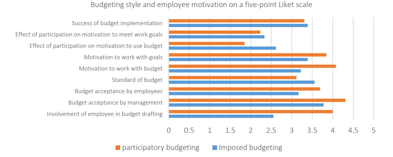
Figure 3. Budgeting style and employee motivation on a five-point Likert scale

Note: a – Predictors, (Constant), budgeting type; b – Dependent variable, employee motivation.