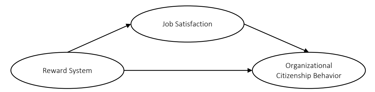
Figure 1. Conceptual framework

H3: Job satisfaction positively influences organizational citizenship behavior.