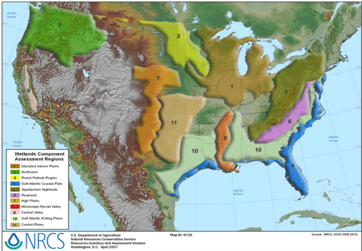
Fig. 1. The Glaciated Interior Plains and other major wetland regions