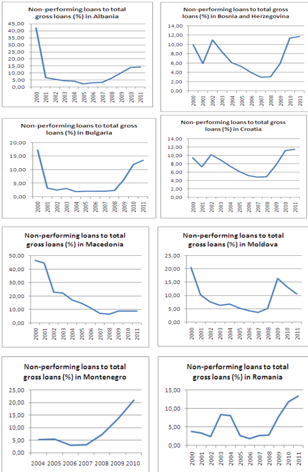
Fig. 1a. Non-performing loans to total loans in Southeastern European banking systems