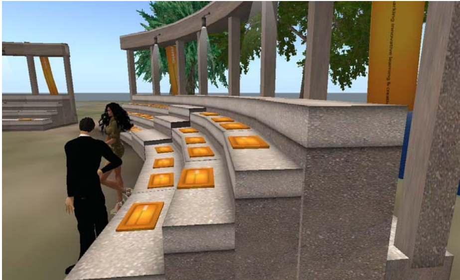
Fig. 1. Meetings and presentations in SL