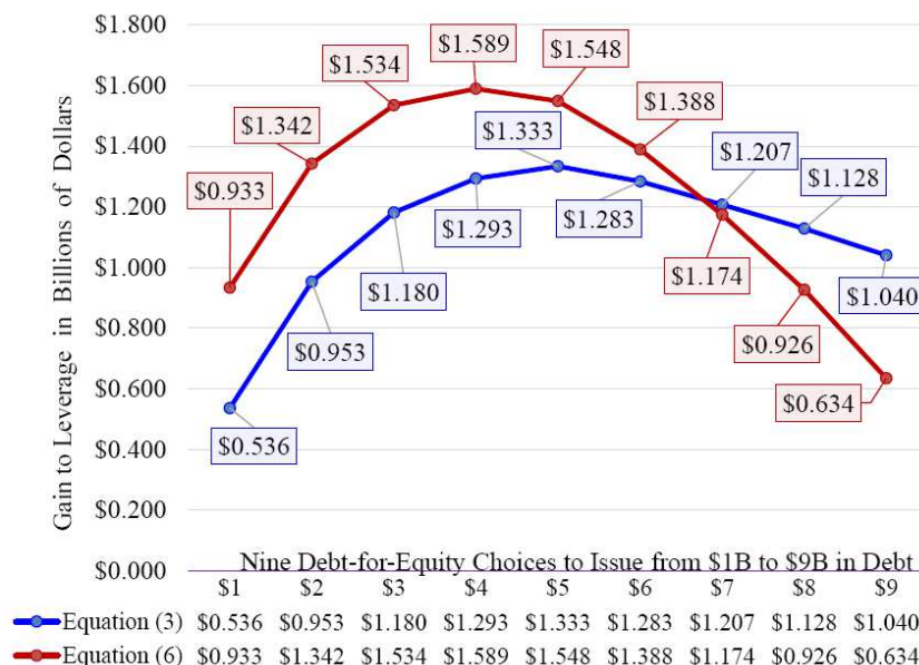
Fig. 1. Optimal G_L increase when tax rates change using equation (6)

When using (6), we have Hull’s three tax rate values of T_C = 0.30 , T_E = 0.05 , and T_D = 0.15 occur at his $5B debt-for-equity choice as this is the middle choice (and also happens to be where the maximum G_L is achieved). To achieve this while allowing a 5% decrease in T_C and T_E for each $1B additional debt, we have to set the following initial unlevered values of T_C = 0.3877 and T_E = 0.0646 . The value for T_D is dependent on the leverage choice even though at the time of the debt-for-equity increment there is no debt and thus no T_D per se. Because T_D has no unlevered value, we set it at T_D = 0.1234 for the $1B debt choice and increase it by 5% to achieve Hull’s rate of 0.15 at the $5B choice. The values for T_C range from 38.77% for the unlevered choice to 24.44% for the $9B choice. The corresponding values for T_E range from 6.46% to 4.07% and for T_D from 12.34% to 18.23%. The values for \alpha_1 range from an unlevered value of 0.6490 to 0.8865 for the $9B choice, while \alpha_2 values range from 1.0352 for the $1B choice to 1.0196 for the $9B choice.