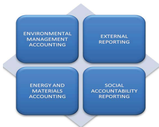
Fig. 3. Internal and external reporting of financial and non-financial data

Some barriers that EMA helps to overcome, as mentioned by Olson and Jonall (2008, p. 40), are management commitment by making managers aware of actual environmental costs, information inconsistency, becoming more efficient and focused, thus resulting in improved environmental and economic performance, and promoting better quality of products through reducing the amount of defective products. In conventional cost accounting, both environmental and non-environmental costs are included under overhead accounts and hidden from management, resulting in incorrect decision making. Figure 3 clearly demonstrates the four approaches to environmental accounting (Olson and Jonall, 2008, p. 19).