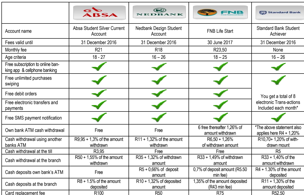
Table 1. Banking fees in SAs bank

The following is a summary of SA's four major banks students' account fees structure.