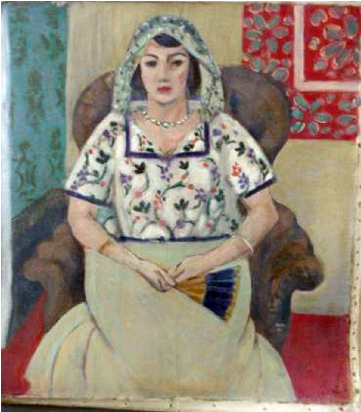
Figure 1. Matisse's "Seated Woman"

Speer allowed for the confiscation of art that ended up in the collections of such individuals as Speer, with greater amounts going to such Nazi leaders as Herman Goring (Winter, 2013). A notable painting was Matisse's "Seated Woman" (1921). This masterpiece was one of many art works he acquired through theft, an art work eventually reunited to its rightful owners (NPR, 2015).