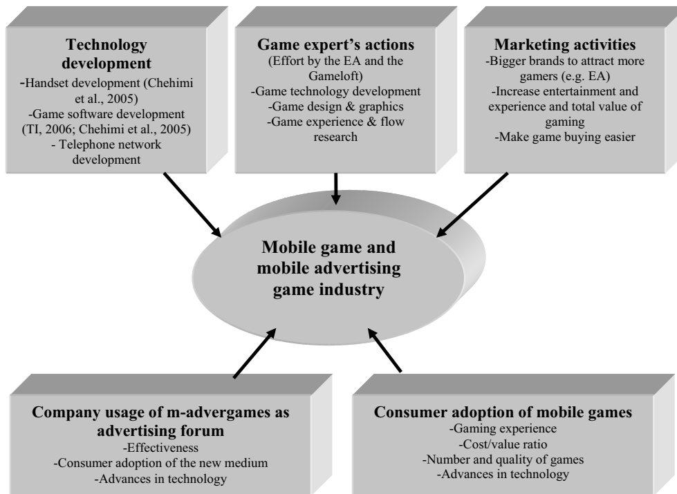
Fig. 4. Factors influencing mobile game and m-advergame industry

The future of mobile games and m-advergames seems to be very promising. There is a plethora of issues that impact the development of mobile game and m-advergame industry. Figure 4 outlines the main issues that will impact the development of the mobile gaming market.