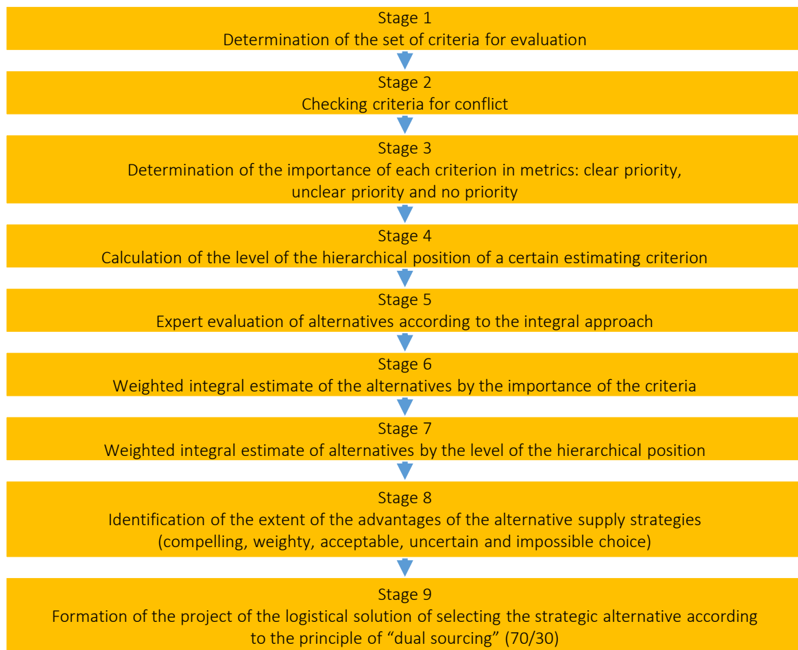
Figure 2. Algorithm of the multi-criteria model of the strategic solution on selecting the suppliers at the market of the material resources