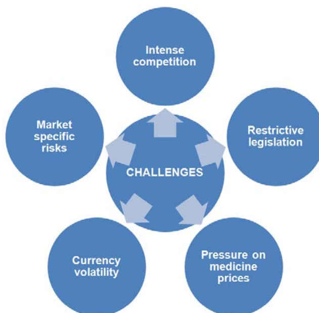
Fig. 2. Aspen “challenge themes”