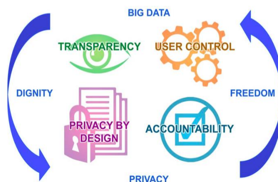
Fig. 3. The link between Big Data and privacy

The point is to balance the interests at stake and to solve complex, technological, legal, organizational, social problems, as summarized in Figure 3.