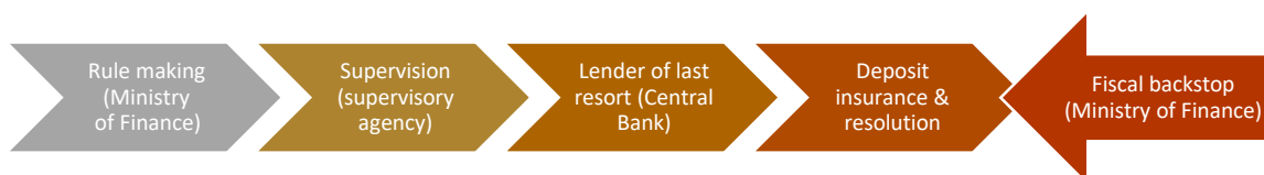
Figure 1. Governance framework of the European Banking Union