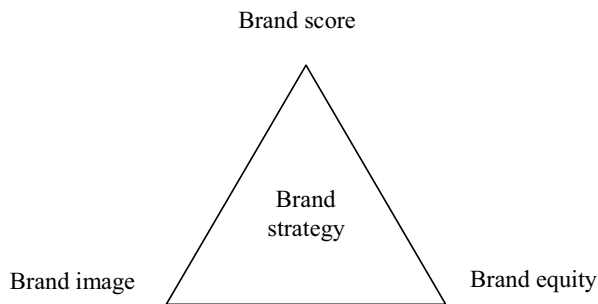
Fig. The linkage between brand score, image and equity

Brand scores – the key driving area for measurement – are linked to image and strategy.