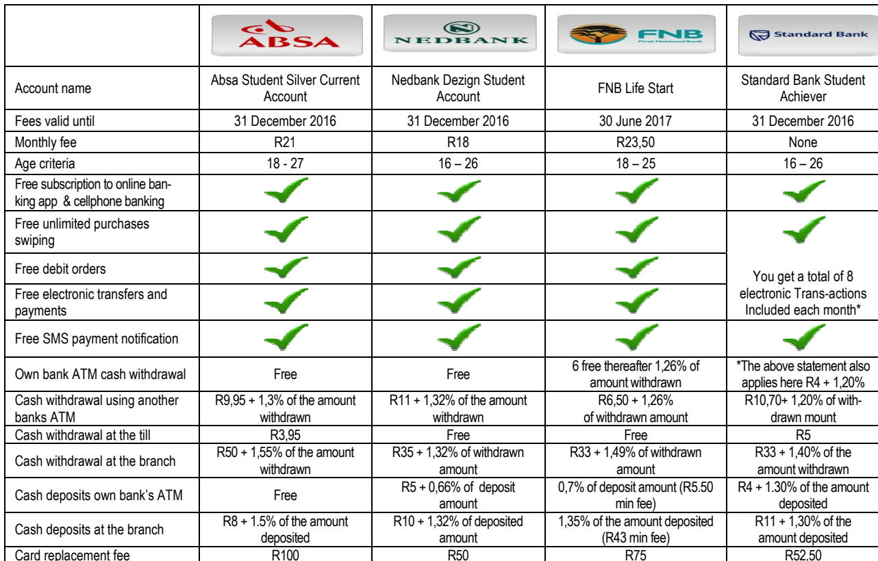
Table 1. Banking fees in SAs bank

The following is a summary of SA's four major banks students' account fees structure.