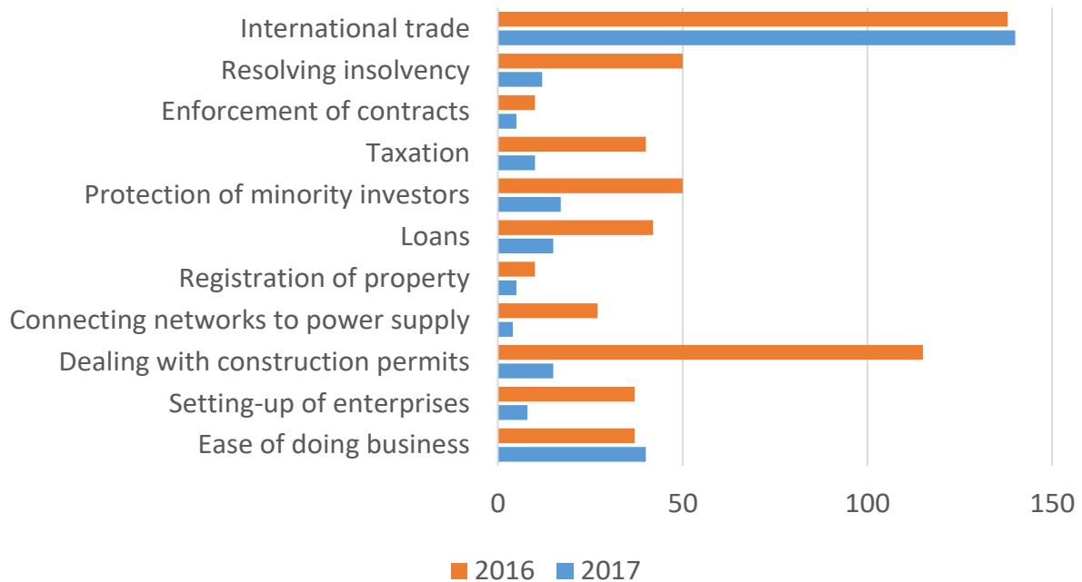
Figure 2. The place of Russia in the ranking on ease of doing business 2016–2017