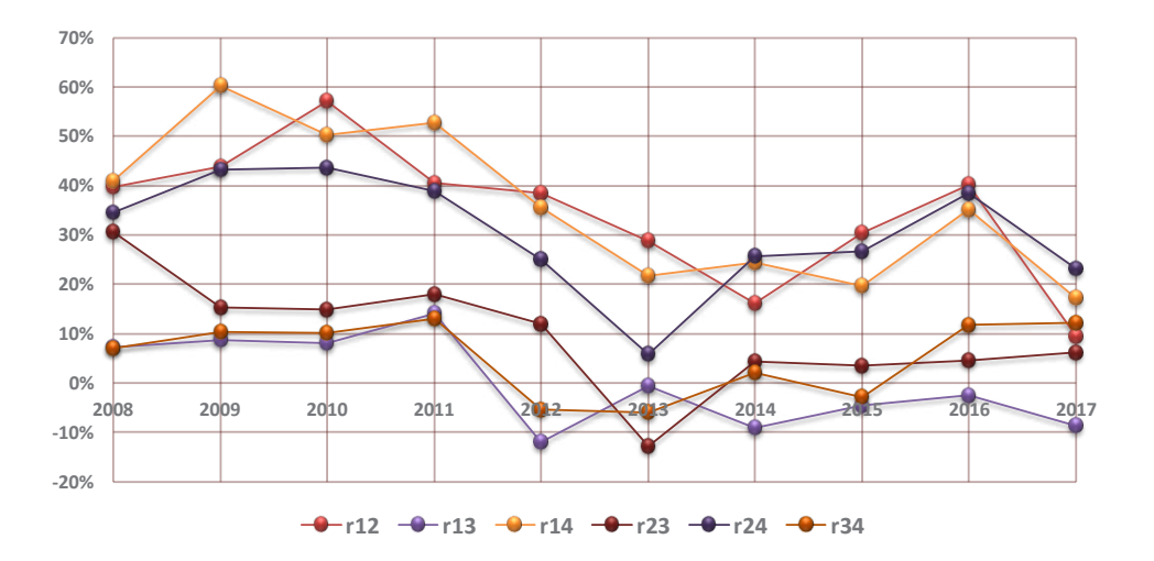
Figure 2. Linear correlation coefficients between each pair of returns variables: MIB (1), oil (2), gas (3) and coal (4).