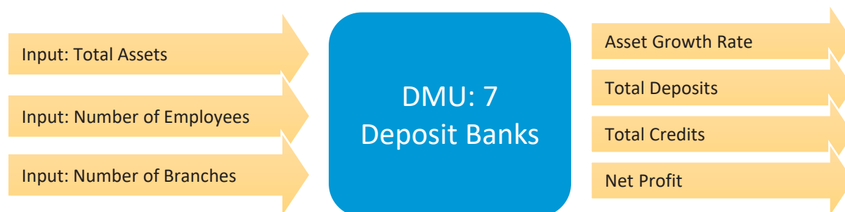
Figure 1. First stage DEA model

The output variables are related to the banks' service and revenue, while the input variables measure the banks' operating costs. In order to evaluate deposit banks' performance, used models are shown in Figure 1 and Figure 2. In the first model, three inputs that relate to costs and physical banking: total assets (Nath, Nachiappan, & Ramanathan, 2010; Samad & Patwary, 2003; Ulucan, 2000, 2002; Zhu, 2000), number of employees (Kahveci, 2011; Samad & Patwary, 2003; Ulucan, 2000, 2002; Yavas & Fisher, 2005; Zhu, 2000) and number of branches (Soteriou & Zenibs, 1999) in 2017; four outputs that relate to service and revenue: assets growth rate, total deposits, total credits (Kahveci et al., 2013); and net profit, in 2017 are used. Then, in