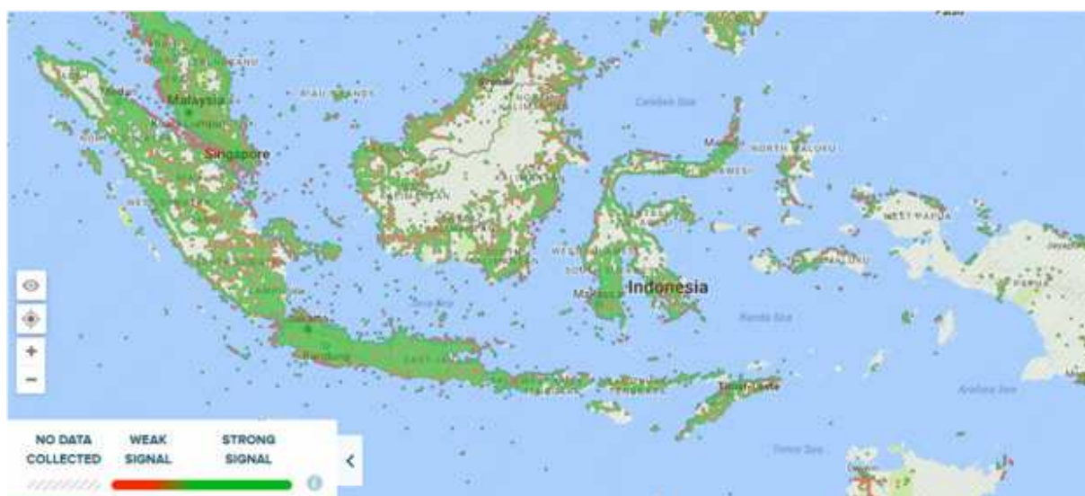
Figure 1. Digital infrastructure map of Indonesia

structure on other islands range from 4 to 7 million people. It seems that they simply ignore those who are living on the other islands, not to mention those in the remote and outer areas.