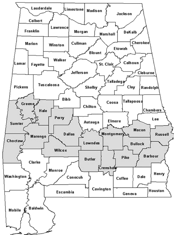
The state of Alabama as a whole is about 25 percent African Americans. The most successful Alabama county, in terms of the most wealth and the most cosmopolitan has to be Jefferson County, with 43 percent African Americans. Leaders from all races in Birmingham intermingle and work together and many of the highest educated people from many racial and ethnic groups live and work in this county. Other similar places include Auburn, Huntsville, Mobile and Tuscaloosa. There are also Alabama counties that have a great percentage of White populations and a very low percentage of African Americans. They are not as wealthy on a per capita basis as much as the main county in the state – Jefferson County (Jefferson County, 2017). Rural areas are often low in per capita income and wealth compared to the higher status urban counties throughout America. The words of the famous urban economist, O'Sullivan explain why, "Cities are where the jobs are". It is natural for many people to leave rural settings in search of a better life in more urban areas (O'Sullivan, 1996).

Communities in the Black Belt of Alabama are perceived as some of the poorest in the nation. In the Black Belt, moderate economic progression is evident and yet there is no clear political agenda for addressing the deep economic disparities that exists, particularly between African Americans and Whites. The only clear revolutionary change that has taken place, which came directly as a result of the Civil Rights and Voting Rights Movement, is that today at the Wilcox county level there are now a majority of African Americans serving in political leadership positions (Jett, 2004). The majority came about a significant number of years after the passage of the Voting Rights Act of 1965, a con-