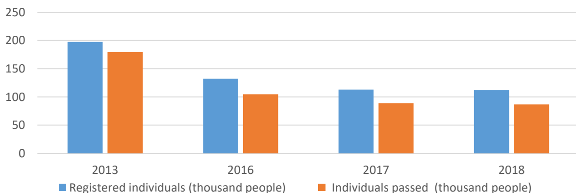
Figure 1. Dynamics of the registration and compilation of EIT in mathematics