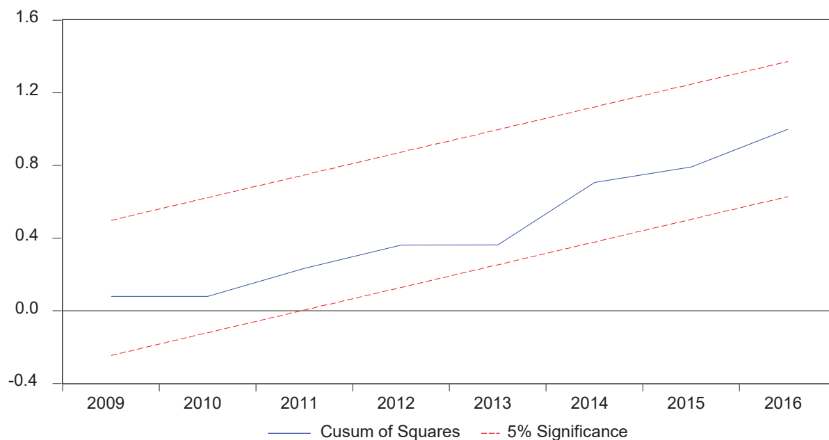
Figure 3. Cumulative sum of residual squared: the broken lines represent the critical bounds at 5% level of significance