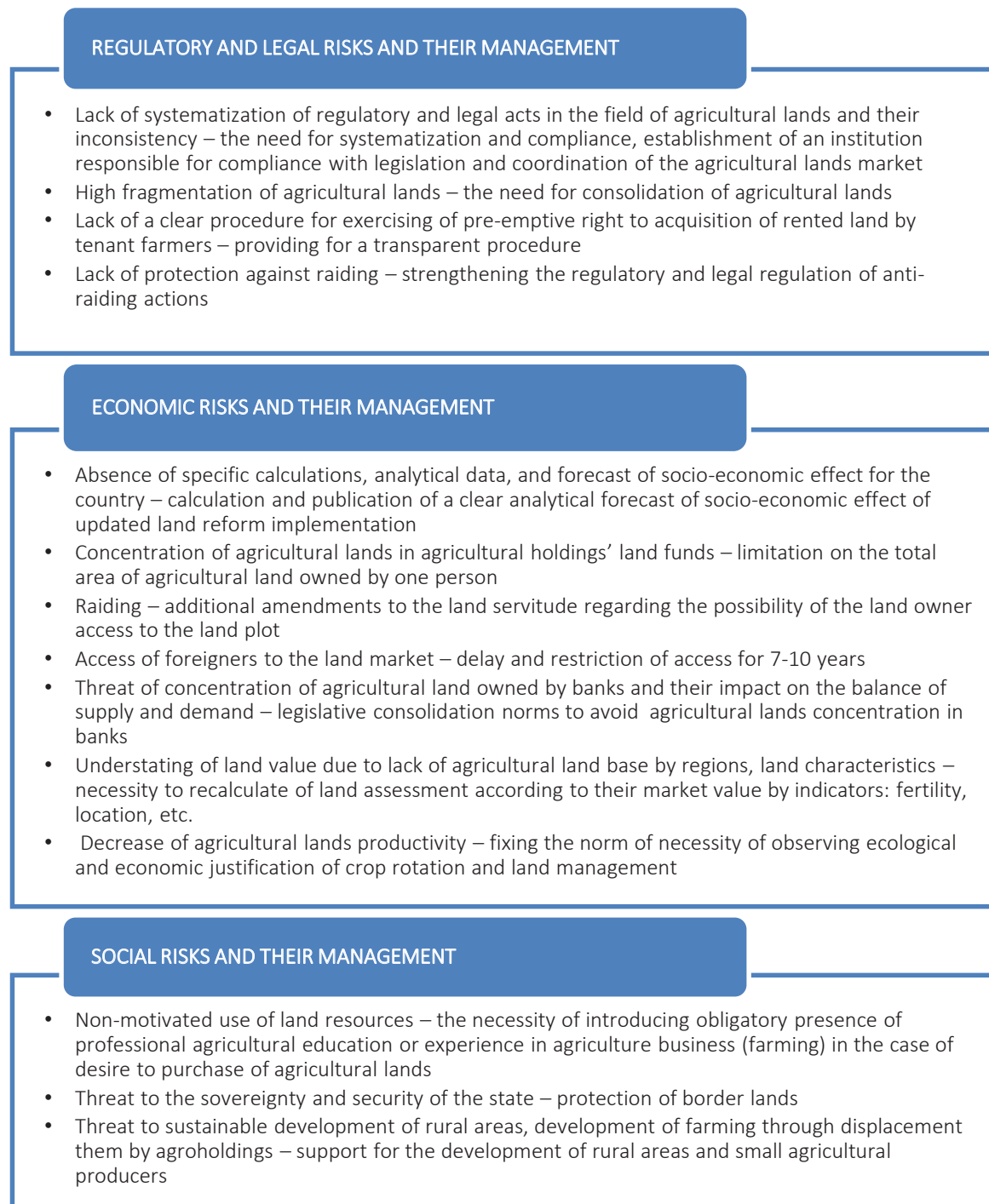
Figure 4. Risks of implementing updated land reform in Ukraine