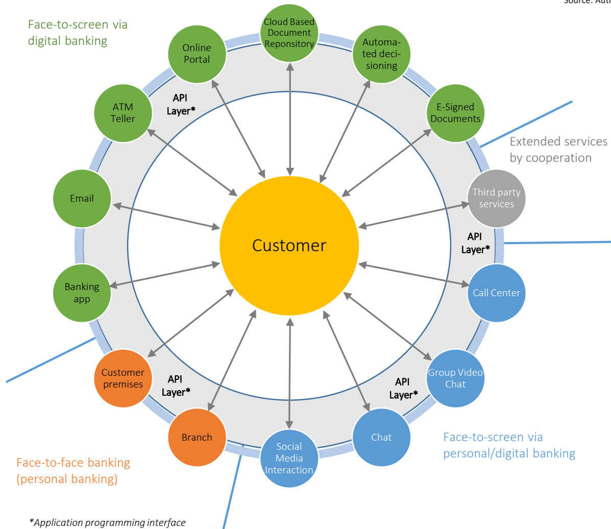
Figure 1. Data management in an omni-channel environment

throughout the entire financial services process. The customer decides independently and according to his present needs, which contact point is the most ideal for him. For the customer himself, the previously different bank channels are perceived as one, only the form of communication is of significance for the customer now.