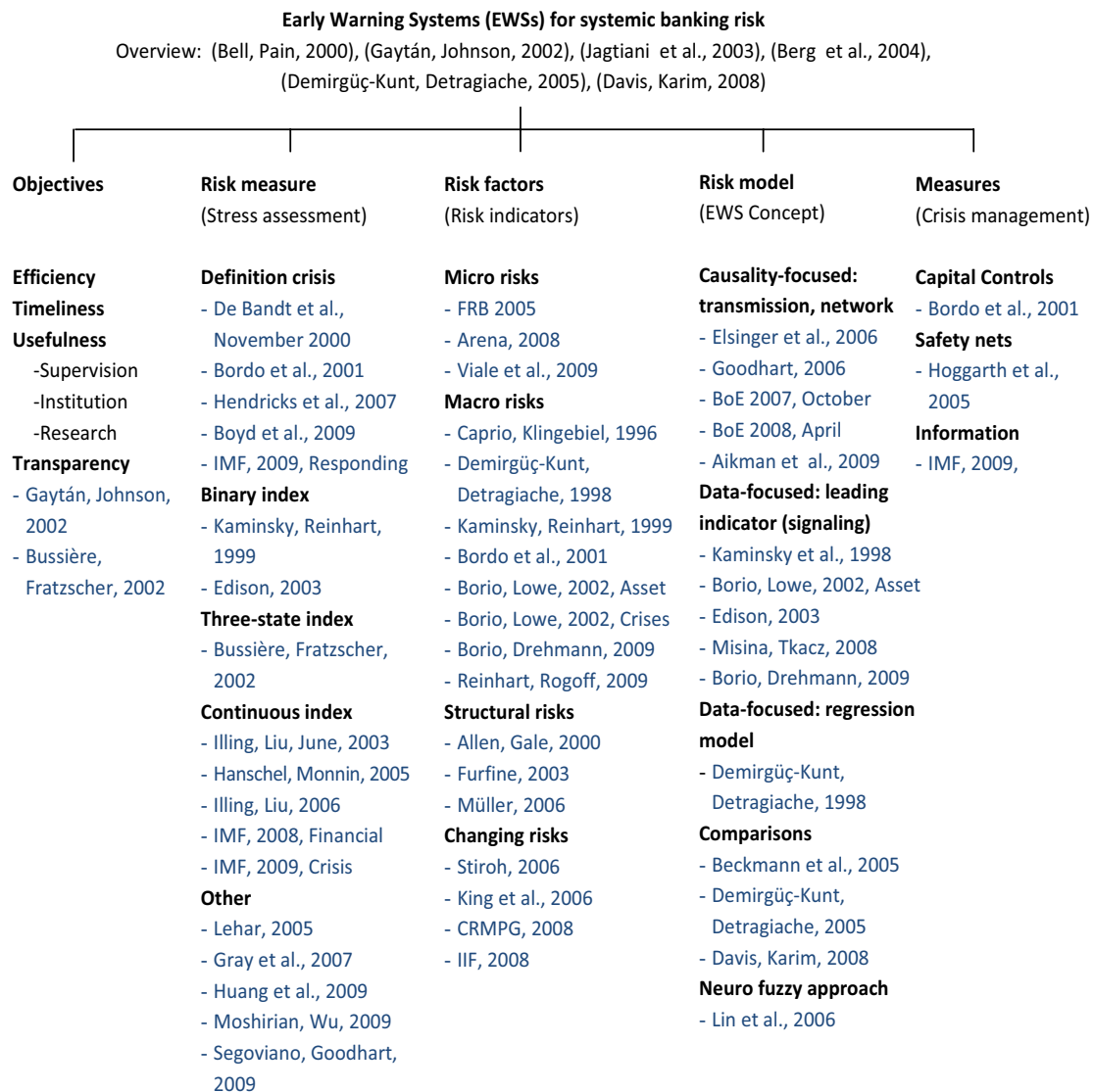
Fig. 1. Key elements of early warning systems

comes of the EWS and the objectives of its user. Gaytán and Johnson (2002, p. 3), and Davis and Karim (2008, pp. 89, 118) emphasize the need for clarifying the user’s objectives in order to model the EWS in a consistent way. De Bandt and Hartmann (2000) point out connections between crisis definition and regulatory policy 2 . As a consequence, in modelling EWSs, special emphasis should be laid on putting together different elements in a comprehensive, integrated framework. An overview of EWSs’ key elements and the related literature is shown in Figure 1.