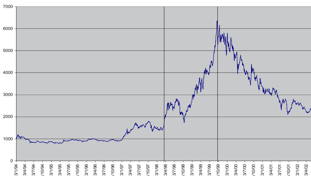
Fig. 1. Evolution of Athens General Index during the period January 1, 1994 – July 31, 2002

It must be pointed out that the second and third regimes describe an up-market (bull market), respectively a down-market (bear market), so it is of major importance to test how beta risk is adjusted to such extreme reactions of the market, and how that can affect a long-term portfolio management strategy, although the trend-reverse dates were arbitrary selected, and not through a trend reversing analysis, so as to focus on the increasing and decreasing market, as defined by the abovementioned market events. Such methodology coincides with Faff and Brooks (1998) regarding their regime selection. Figure 1 represents the Athens General Index, and the subperiods previously described.