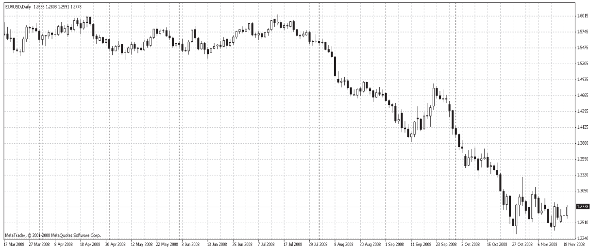
Fig. 1. The daily chart of EUR/USD quotes in 2008

year – on gold, 2 years later – on the stock market and so on. As a visual illustration of the proposed hypotheses, we will show the daily chart of oil and EUR/USD in 2008 (Figures 1 and 2) [3].