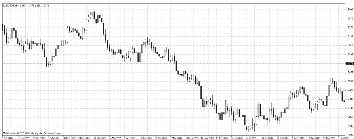
Fig. 3. The daily chart of EUR/USD quotes in 2005

However, the comparison of the same exchange instruments, in the year of 2005 gives a completely different picture (Figures 3 and 4) [3].