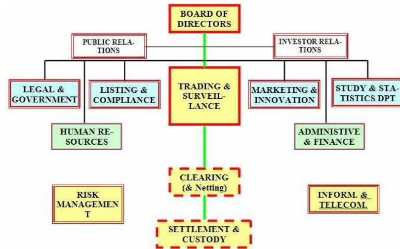
Fig.2. Reference organisation chart of a stock exchange

2.2. Advantages of consolidation. 2.2.1. Avoiding duplications. There are four areas where consolidation has a strong impact: Trading & Surveillance, IT department, Administrative & Finance, and Risk Management.