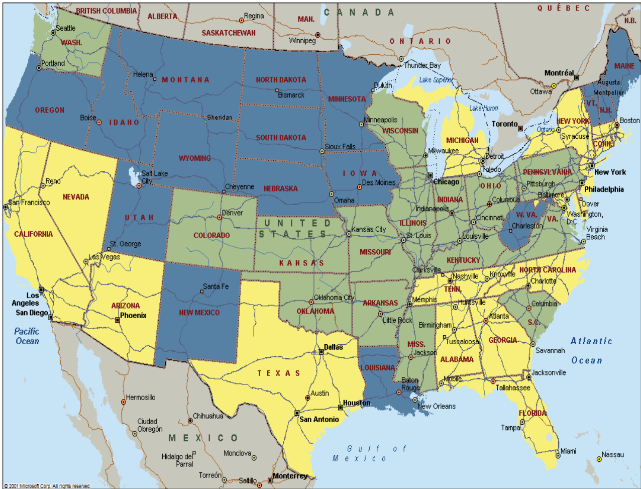
Fig. 2. MPI, state variation, 3 rd quarter 2009, Traditional Medicare