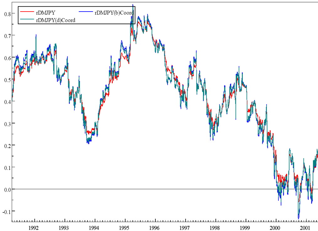
Fig. 3. Dynamic conditional correlations of the DM(EUR)/USD and the JPY/USD returns, including those from columns (b) and (d) of Table 5

These results could be of great importance for central banks' decisions on conducting coordinated interventions in a currency. According to these results if central banks wish to reduce exchange rate volatility, then it is preferable to intervene in coordination with only one another central bank and not in coordination with another two central banks; if intervention occurs in coordination with more than one another central bank it will not have the anticipated outcome. If a central bank wishes to affect its exchange returns it