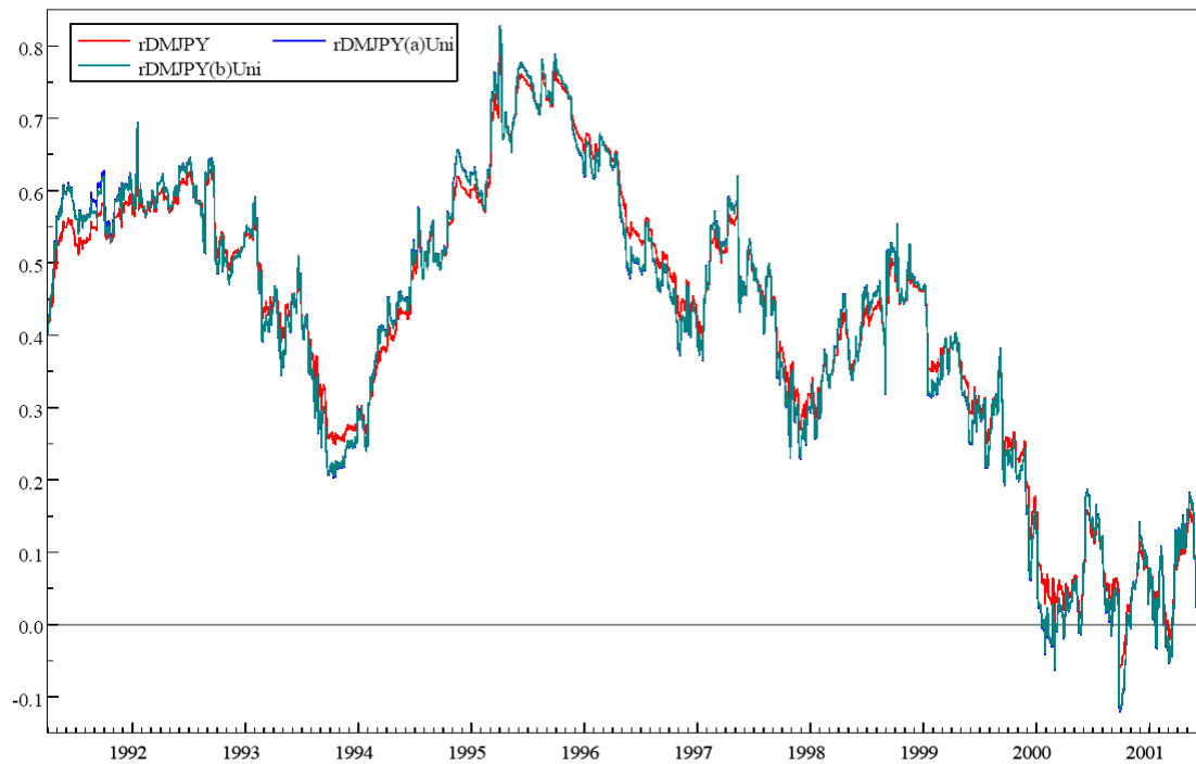
Fig. 4. Dynamic conditional correlations of the DM(EUR)/USD and the JPY/USD returns, including those from columns (a) and (b) of Table 6

2.5. Robustness analysis. Having found evidence that unilateral interventions are more productive as opposed to coordinated interventions of 2 or 3 central banks under the G4 assessment, as the former affect returns and in minor cases reduce volatility, in this section several robustness checks are being performed. In order to check the robustness of the results regarding the impact of the