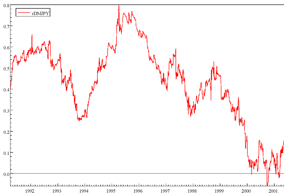
Fig. 2. Conditional correlations of the DM(EUR)/USD and the JPY/USD returns

The DCC model seems to perform very well in terms of capturing the DM(EUR)/USD and the JPY/USD exchange rate dynamics: (1) both exchange returns exhibit heteroskedasticity, based on the significant estimated coefficients of the individual GARCH models; (2) the conditional correlations of the DM(EUR)/USD and the JPY/USD returns are highly persistent as shown by the significant parameter estimates ( \alpha and \beta ) of the DCC GARCH model; (3) Li and McLeod (1981) test (which is a multivariate version of the Box-Pierce/Ljung-Box portmanteau test statistic for serial correlation) cannot reject the null hypothesis of no serial correlation on both standardized and squared standardized residuals, up to 20 lags; (4) the DCC model indicates that the correlations between these two returns are indeed time-varying. This can also be clearly seen in Figure 2, which plots the dynamic conditional correlation of the estimated DCC model in Table 4. The correlations during April 2, 1991 to October 19, 2001 vary between -0.05 to 0.8. Beginning from 1991, correlations between those two markets gradually declined till 1994, then there was an increasing trend till the mid-1995 followed by a declining trend till the end of 2000 when they became negative. Since the beginning of 2001, correlations varied around -0.05 to 0.2.