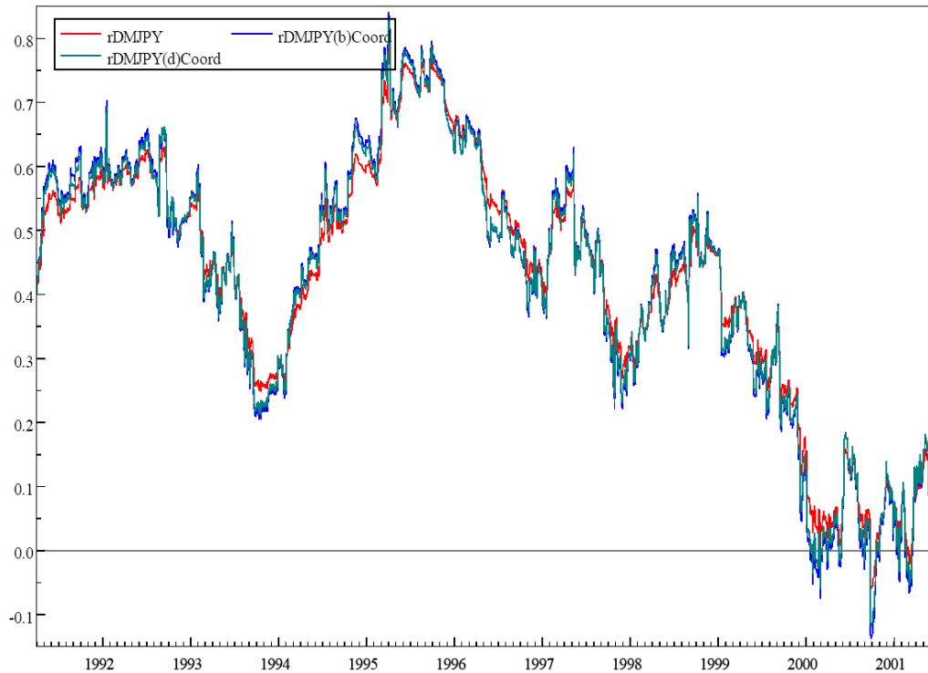
Fig. 3. Dynamic conditional correlations of the DM(EUR)/USD and the JPY/USD returns, including those from columns (b) and (d) of Table 5

These results could be of great importance for central banks' decisions on conducting coordinated interventions in a currency. According to these results if central banks wish to reduce exchange rate volatility, then it is preferable to intervene in coordination with only one another central bank and not in coordination with another two central banks; if intervention occurs in coordination with more than one another central bank it will not have the anticipated outcome. If a central bank wishes to affect its exchange returns it