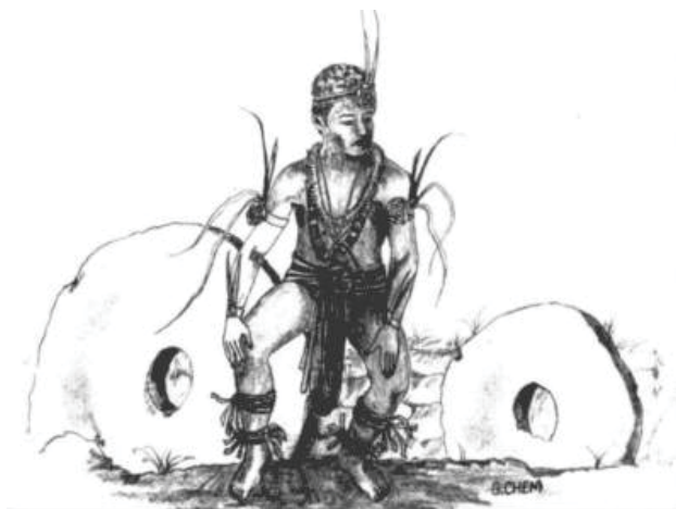
Fig. 2. Yap stone money