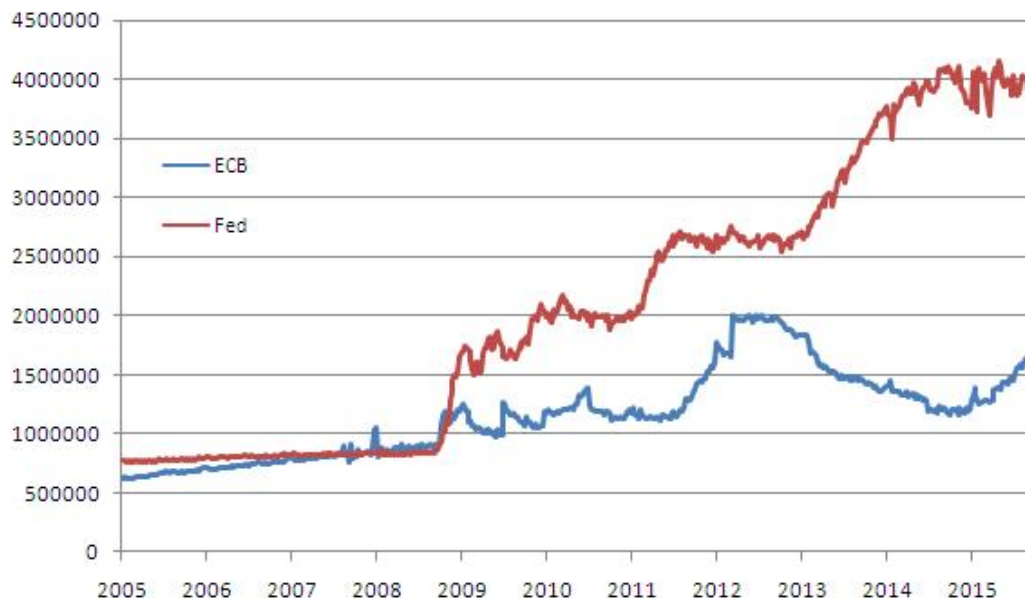
Fig. 2. Monetary base of the Fed and the ECB

three years. This is also the reason why the monetary base in the Euro area has fallen since the end of 2012, because the liquidity provided is repaid by the financial institutions. However, with the QE-program announced in January 2015 and its subsequent prolongings, the ECB balance sheet is expected to increase even further until the end of 2017.