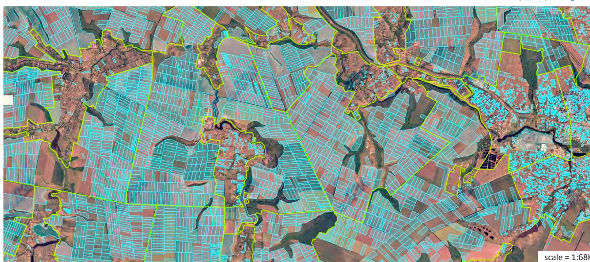
Figure 3. Cadastral map of key plot 2