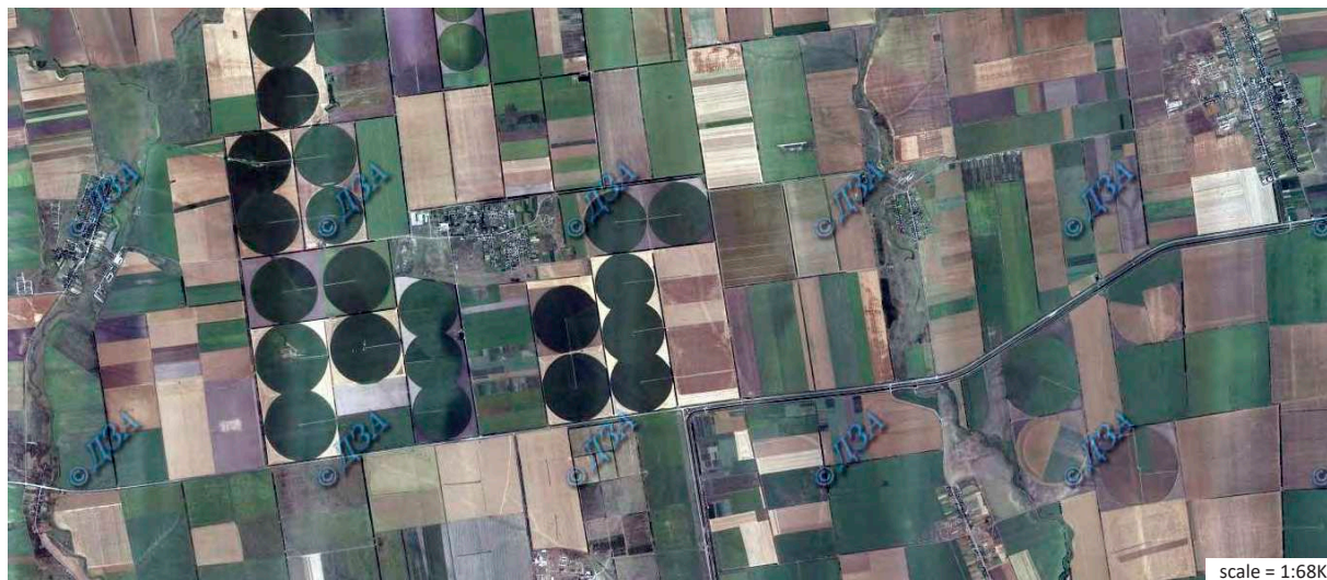
Figure 6. Orthophoto image of key plot 3

On Figure 6, typical pattern of surge irrigation – green circles – can be seen easily. Some of these circles are very contrast, thus owners of small land parcels manage irrigation together or rent their land to a single farmer. Some of these circles on the right side of the image are hardly noticeable, then, irrigation was interrupted, but physical properties of cultivated soil were changed already.