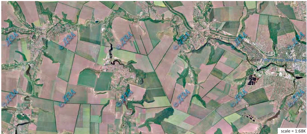
Figure 4. Orthophoto image of key plot 2

ownership, it may contain not only agricultural lands, but also forestry or mining.