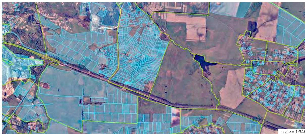
Figure 1. Cadastral map of key plot 1