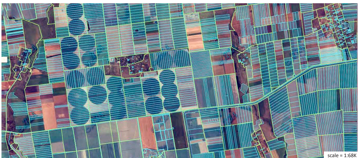
Figure 5. Cadastral map of key plot 3

The third key plot was chosen near Vysoke village of Melitopol district of Zaporizhia region in steppe zone (Figures 5, 6).