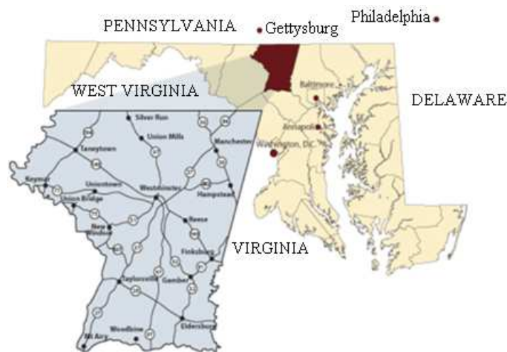
Fig. 1. Baltimore/Washington, D.C. metro area